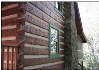
Custom 6x12 Log Home with Edge Chamfer for a rustic Antique look.

The economy, banking system, real estate market and residential construction industries are in a state of near collapse. The log home industry, as part of the construction industry, is facing the same challenges as the residential construction industry.